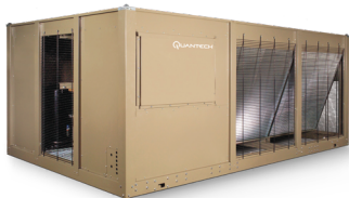
QTC2 Air-Cooled Scroll