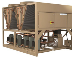
QTC3 Air-Cooled Scroll