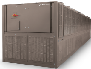
QTC4 Air-Cooled VSD Screw