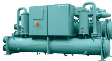
QWC4 Water-Cooled VSD Screw