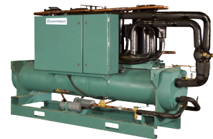
QRC3 Water-Cooled Scroll Remote Condenser