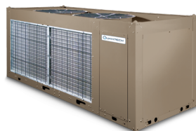
QCC2 Air-Cooled Scroll Condensing Unit