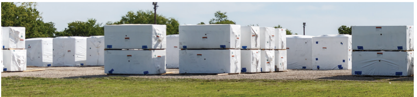
Quantech chillers are stocked in San Antonio, Texas, with air-cooled and water-cooled products ranging from 15 to 375 Tons.

When a chiller is mission-critical, the emergency replacement sale goes to the contractor that can get the right unit there quickly. Our Quantech® air-cooled chiller inventory is there to support you. You can have an efficient, reliable chiller - with the features you want - on site in two to five business days.